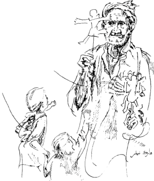
SELLER OF HANDMADE PAPER TOYS